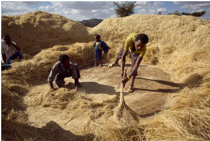
Harvesting teff in Ethiopia