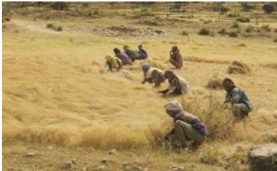
Teff farmers in Ethiopia